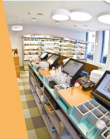
Touch Pos JZ - TI310